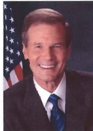
Senator Bill Nelson

Senator Nelson was able to briefly preview our facilities as we drove him to his SATSair flight.