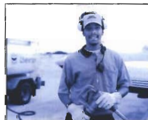
FBO "Valet Service" is the first of its kind.

of our tenant, we then present a snack item and drink to finish the service. We have had some tenants inquire about the service and all FBO and required SAA staff are trained to respond. The new t-hangar tenants are very impressed as we are the first in our area to provide this level of service.