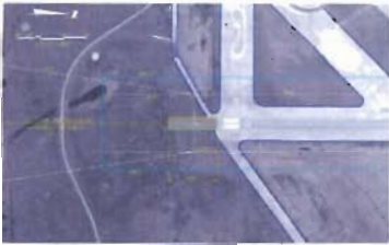
View of proposed extension to Runway 36

“As soon as the airport can show a demand of 500 annual operations from aircraft requiring the additional length, the FAA will authorize moving forward with the Environmental Assessment.”