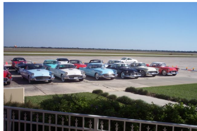
Trail Birds Airside

were, "remember they are just cars and cars are made to be driven."