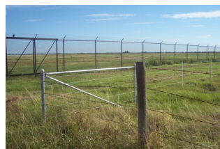
New Security and Cattle Fence

"Everything that is really great and inspiring is created by the individual who can labor in freedom." Albert Einstein (1879 - 1955), 'Out of My Later Years,' 1950