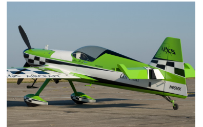
Extra Aerobatic Aircraft

which progress through simple loops and rolls to intricate multiple inside and outside maneuvers. Trained judges score each competitor on how each sequence is performed. Competitors compete for trophies, achievement awards and national and international recognition.