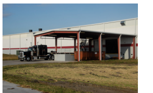
Landscaping segment of project will start soon.

and closeout of the grant still need to be resolved as well. In the meantime, Funder America has full use of their production line.