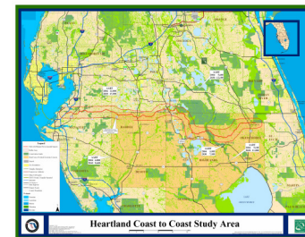
Depiction of East-West Corridor.

begin organization of a group that will represent the project and be responsible for championing the initiative to the private sector, local, state, and federal governments.