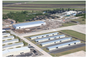
New Commercial/T-Hangar and Funder projects

The Commerce Park site was submitted as a part of our pack-