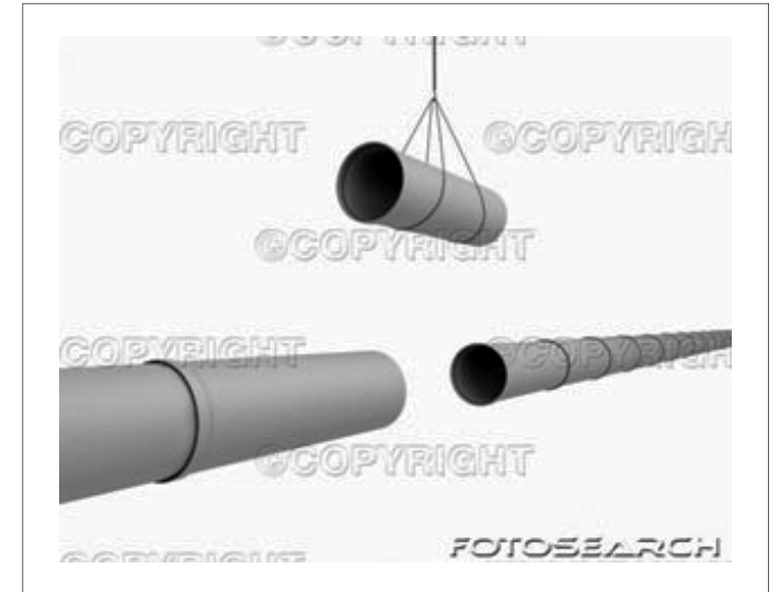
The CRA's assistance to projects like the Gas Pipe may be doubtful in the future.

On October 10th the Florida Supreme Court heard oral argument on the rehearing request in the case of Strand vs. Escambia County, Florida. The original opinion in this case issued on September 6th said that tax increment financing required voter approval of the financial obligation was for more than 12 months. Today, the Court seemed to appreciate the difference between the TIF system set up by Escambia County under Chapter 125, Fla. SS and a CRA under Part III, Chapter 163, Fla. SS. The Court was well prepared and had obviously read the briefs filed with it by the parties, including the Florida Redevelopment Association. Former Supreme Court Justice Steve Grimes, now with Holland & Knight in their Tallahassee office, appeared on behalf of FRA. The Court seemed concerned that many had relied on the Miami Beach case over the past 27 years and per-