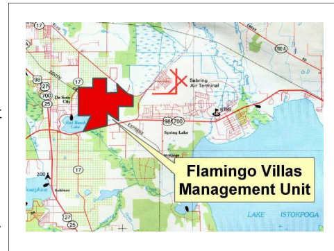
Flamingo Villas contains approximately 1,100 acres

Garrett's scrub balm (shown here), is a woody mint plant known only from Highlands County. This plant occurs on the Flamingo Villas management unit.