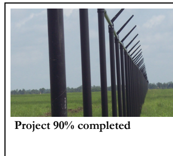
Project 90% completed