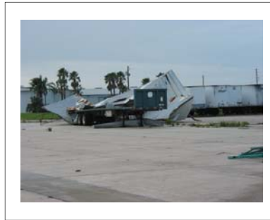
Modular T-Hangar pod near Bldg 60

The ability to continue communicating is also a major consideration and needs to be dealt with so that work can continue, even with no power. Satellite communications with external building-mounted antennas that allow cordless handset plug-in are essential to efficient after event operations.