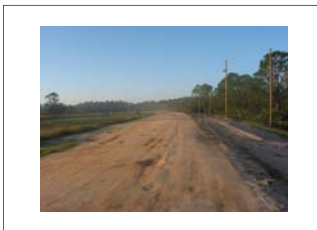
Haywood Taylor Blvd. 10-18-04

problematic at best for many reasons. We are working with County staff to see what actions might be taken to insure the use of the roadway, if only for Race Week.