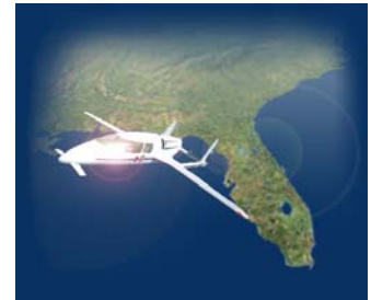
SATS conceived "Air Taxi" could revolutionize access to small communities

I have attached an interesting article regarding the new "micro-jets" and the impact that this technology could have on transportation.