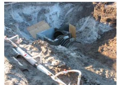
Dewatering and pipe installation

Progress Energy is moving power poles along the roadway that will interfere with construction activities. The work seems to be proceeding at a pace that should not hinder the overall progress of the project.