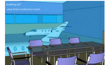
Upper level conference room.