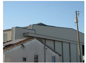
Building 60 roof and trim damage

exacerbated problems with controls and piping. The backup electrical generation project is in the works for the Airside Center, Fuel farm and WWTP.