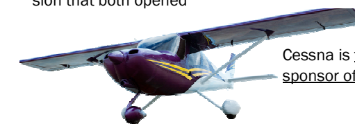
Cessna is the name and title sponsor of the Expo for '08!

general aviation manufacturer became an official member of the light sport aircraft business.