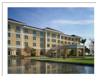
Four Points adding Ballroom and 34 new rooms/suites!

42 new rooms and suites will also be added enabling the property to be competitive in attracting larger groups and events.