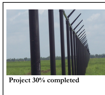
Project 30% completed

This project will provide security requirements per FAA guidelines as well as providing a barrier for cattle grazing activity.