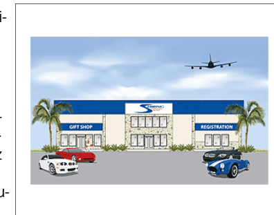
Sir New Administration Building

Since acquiring Sebring International Raceway in 1998, Panoz Motor Sports Group